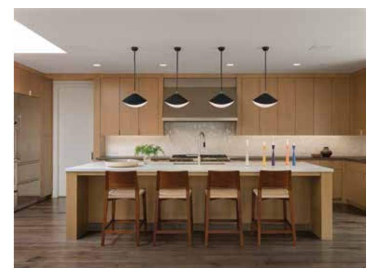
ABOVE: A set of McGuire barstools line the island with four Mouille-style library ceiling lamps that float above. BELOW: The backside of the home features multiple areas of entertainment including a dining area and several lounge areas. Expansive Tuuci umbrellas cover much of the seating, which came from Sutherland.

The interior design acknowledges the home's early-1960s origins without leaning on heavy-handed references. Classic mid-century pieces by Vladimir Kagan and Eero Saarinen and Serge Mouille-inspired lighting are juxtaposed with contemporary custom elements. Gracious seating areas and luxurious soft surfaces abound, making light-flooded spaces feel welcoming and practical. The indoor-outdoor flow has been strengthened so the homeowners can better enjoy Halprin's original landscape scheme, which was one of his rare residential undertakings. Strata Landscape Architecture. also improved the water efficiency with the pool and fountain systems and created more user-friendly exterior places. In sum, it's an ideal way to live in concert with significant architecture and design history.